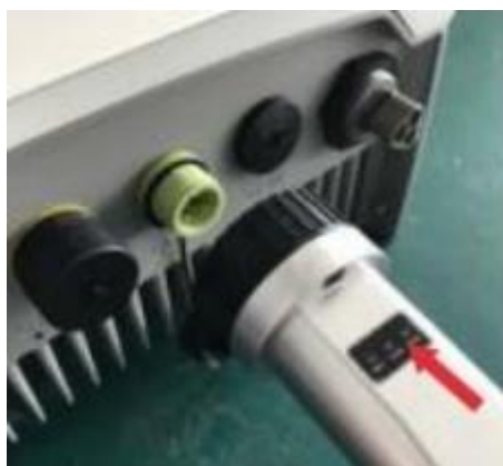
Insert the Logger